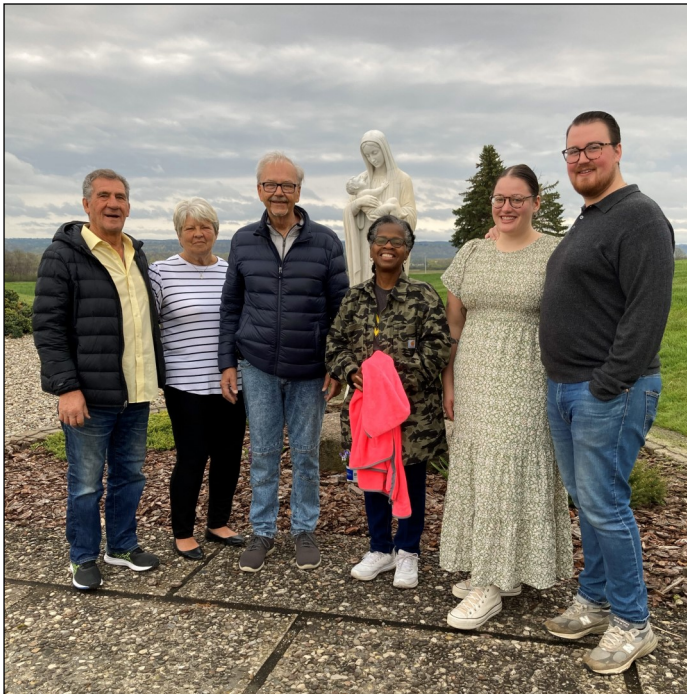
Genesee Abbey Retreat

330-743-1109 E-mail: StPatricks@neo.rr.com Website: www.StPatsYoungstown.com